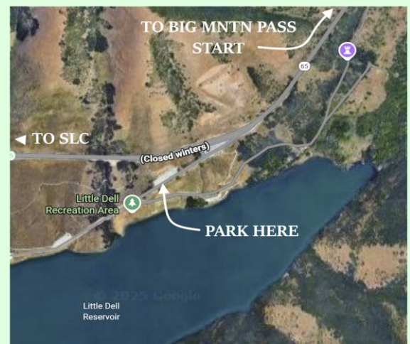
FINISH Little Dell Reservoir